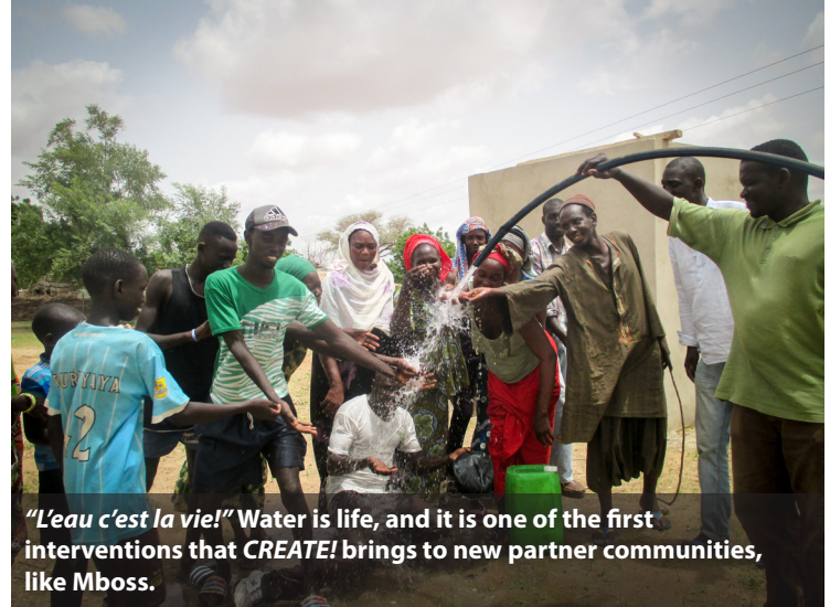
"L'eau c'est la vie!" Water is life, and it is one of the first interventions that CREATE! brings to new partner communities, like Mboss.

Thousands of traditional wells still dot rural Senegal, offering untapped potential as sources of clean, affordable water. CREATE! works with volunteers in our partner communities to rehabilitate these abandoned wells and install solar pumps