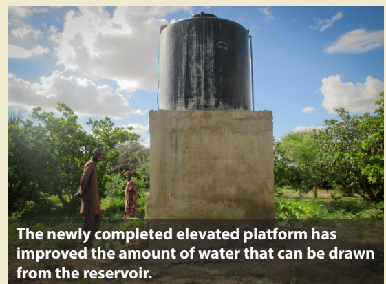
The newly completed elevated platform has improved the amount of water that can be drawn from the reservoir.

“Since the elevation of the platform, we have noticed increased water pressure in our garden,” said Khady Kebe, enabling them to better irrigate the entire garden site. This story exemplifies how CREATE! training builds community empowerment in rural Senegalese communities. The Fass Koffe cooperative had the technical expertise, the funds, and the leadership skills needed to fix their gravity-fed irrigation system - without any help from CREATE! .