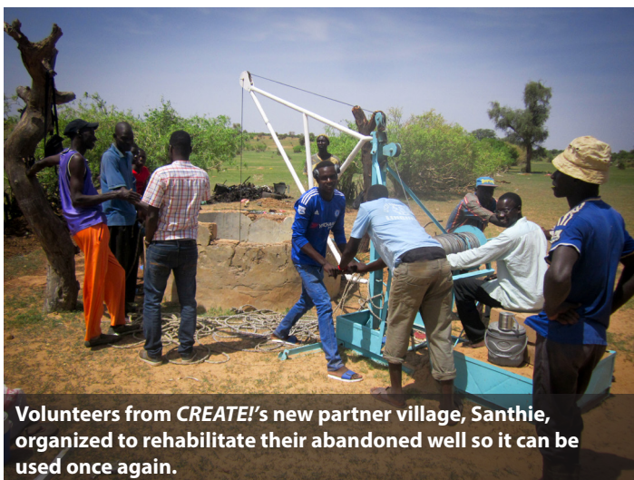
Volunteers from CREATE! 's new partner village, Santhie, organized to rehabilitate their abandoned well so it can be used once again.

Renewable energy and appropriate technology, coupled with appropriate participatory implementation strategies, lie at the core of CREATE! 's village self-development model. We wanted to develop an effective, low-cost, and local solution to clean out these abandoned wells. Small-scale, appropriate technology is a vital part of CREATE! 's identity, and one of our founding principles. For us, "appropriate" means a technology, approach, or implementation strategy that is adapted to the local environment, accessible to the local population, low-cost, uses locally available resources and materials, can be easily taught and understood, and is easily replicable.