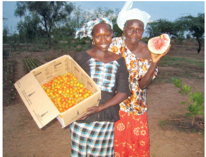
In 2014, Ouarkhokh cooperative groups harvested more than 6,800 pounds of produce from their gardens.

four-acre garden site twice daily to water their crops. Although time and labor intensive, their hard work has paid off. The cooperative grows a variety of crops, including eggplant, okra, peppers, tomatoes, and lettuce. Participants are able to bring produce home to their families and in 2014 members harvested and sold thousands of pounds of produce to local markets. As their skills have increased, women in Ouarkhokh have also focused on producing high-value crops like mint and lettuce, which are often difficult to find in rural Senegal. Focusing on these crops boosts the revenue brought in by cooperative members.