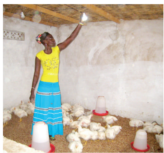
Ouarkhokh cooperative group members are already planning to build another chicken shed so they can meet the growing demand for poultry in their community.