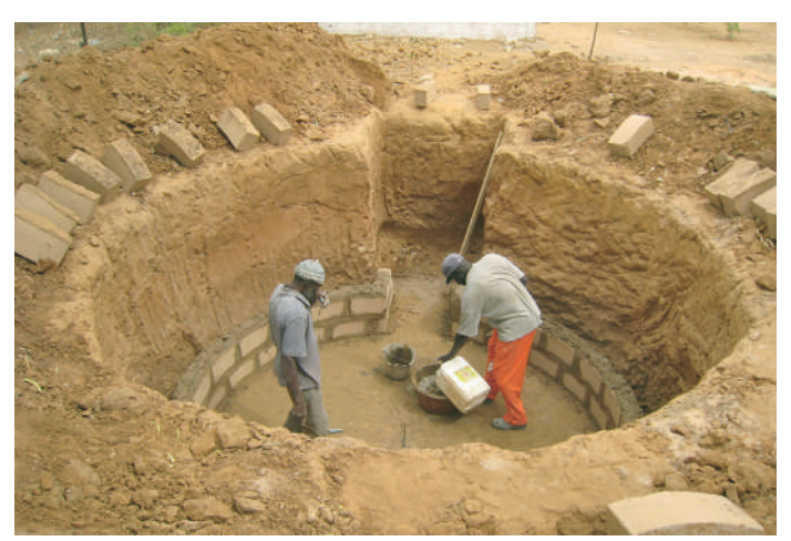
Masons from the community of Ouarkhokh are working with CREATE! to build a biodigester that will provide methane gas for lighting and cooking.

thrilled to demonstrate this new method of sustainable and technologically-appropriate energy production. Women will also be able to use gas from the biodigester to cook meals at the garden site.